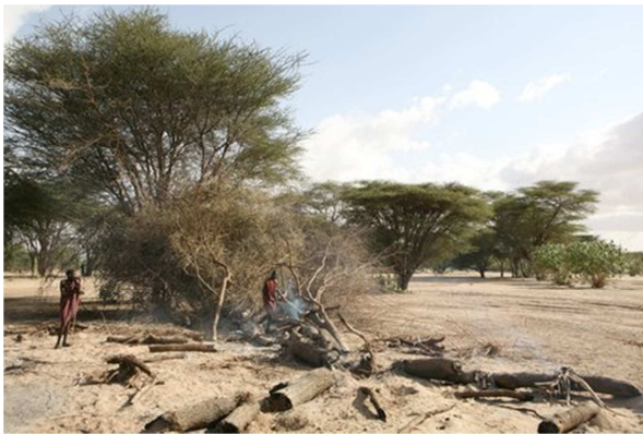
Figure 2. Fuel requirement as a reason for deforestation.